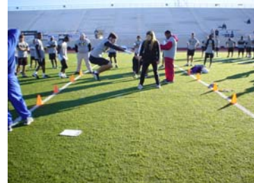
High School combine participant being tested in the broad jump.